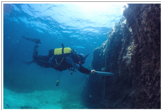
Fig. 1. Posidonia oceanica mat deposits in Portlligat (Western Mediterranean).

From the Py-GC-MS and THM-GC-MS data, the P. sinuosa is much more similar to its southern relative than to the Mediter-